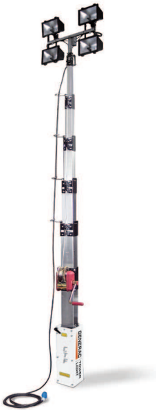
CTF 5,5 - CTF 7 - CTF 9