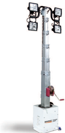
CTF 5,3-L - CTF 5,3-MH